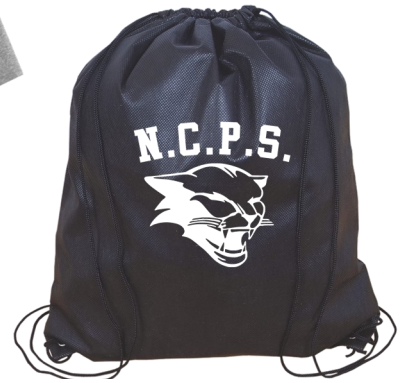
CINCH BAG - $10