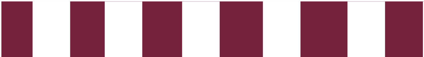
T-SHIRT - $17